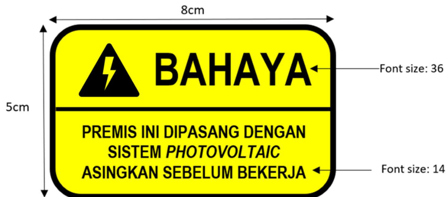
Figure 2: Sample of label